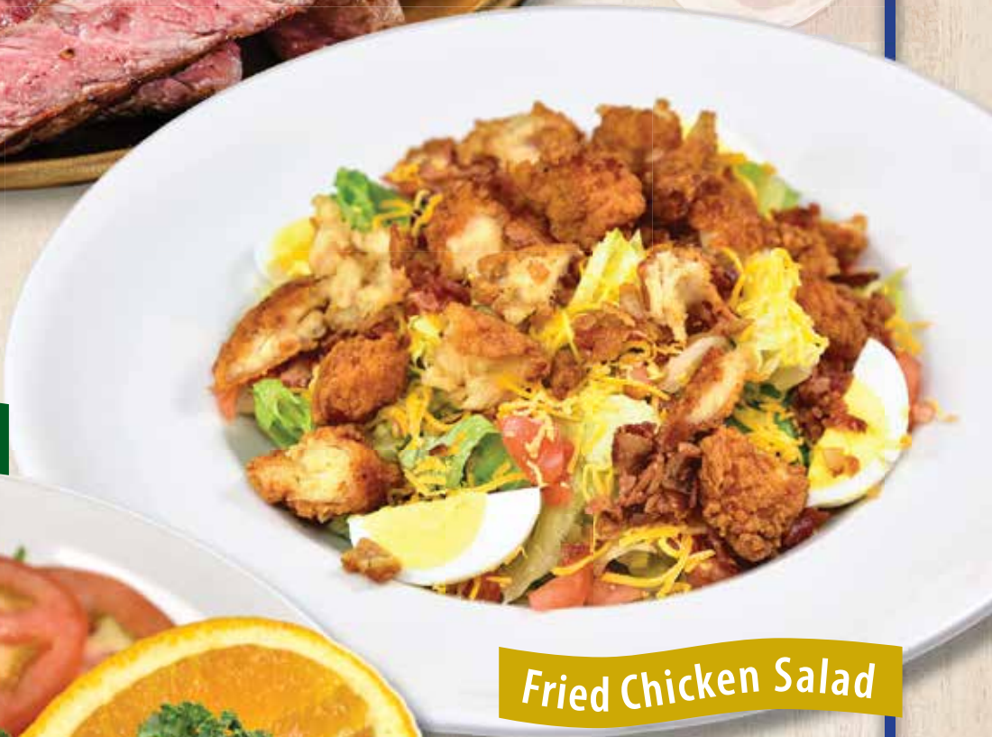
Fried Chicken Salad